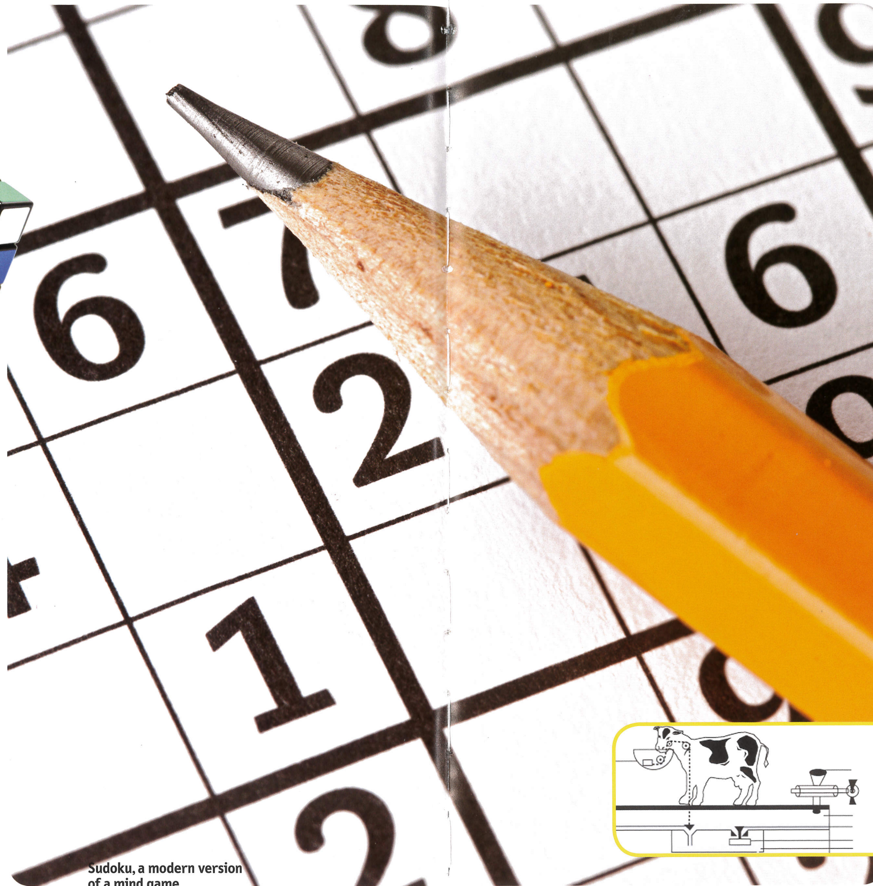
Sudoku, a modern version of a mind game

Published around 850, the Banu Musa brothers' Book of Ingenious Devices illustrated more than 100 trick gadgets and machines .